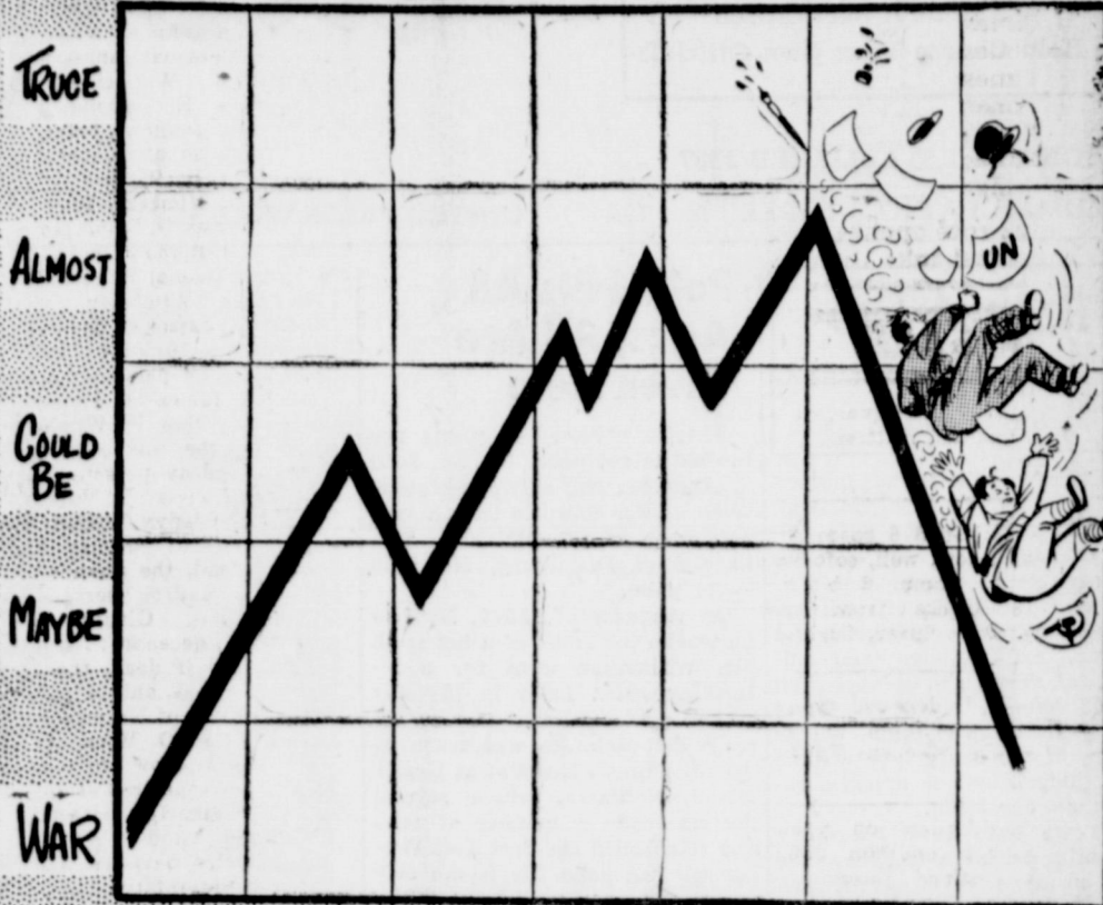
KOREAN NEGOTIATION CHART