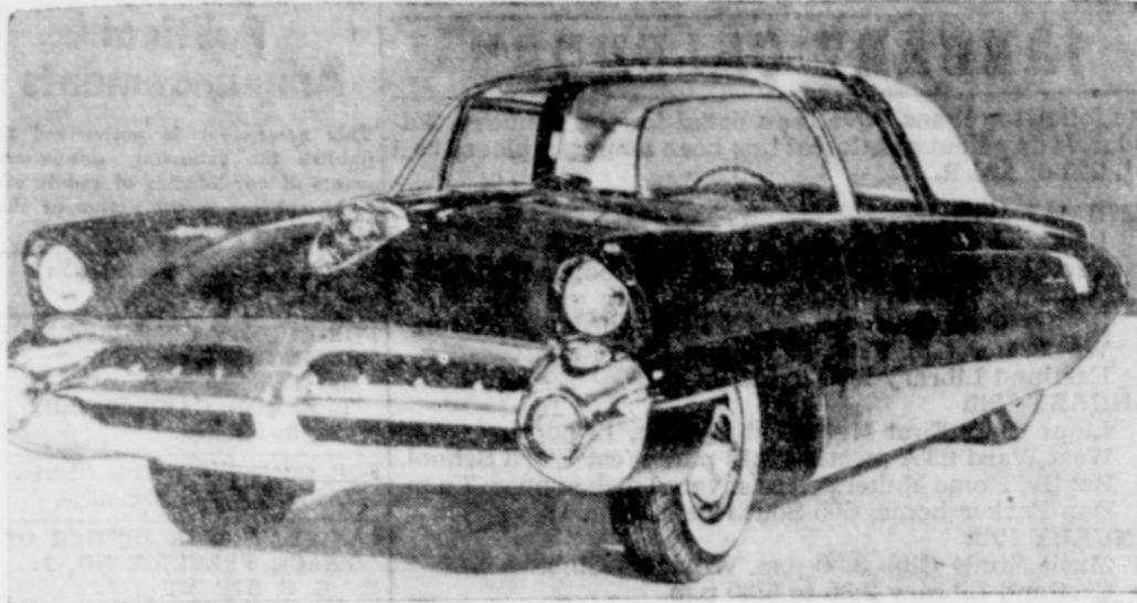
THE FORD IN YOUR FUTURE?—A partly glass-domed convertible with rocket-ship lines is the "Continental 1950-X," built by Ford as its version of the American "dream car." Not in production, but built as a design model, the 1950-X has a glass dome-like windshield that carries back to the rear of the front seat. The dome is retractable into the leather-covered steel rear top. Between the two front seats is an instrument panel for telephone, dictaphone, automatic wheel jacks and hood and trunk controls.

The Home Makers Class covered dish supper and regular monthly meeting postponed from last Tuesday will be held at 7 p.m. Tuesday in the home of Mrs. Don Parker, 605 South Bassett Street. All members and prospective members were invited.