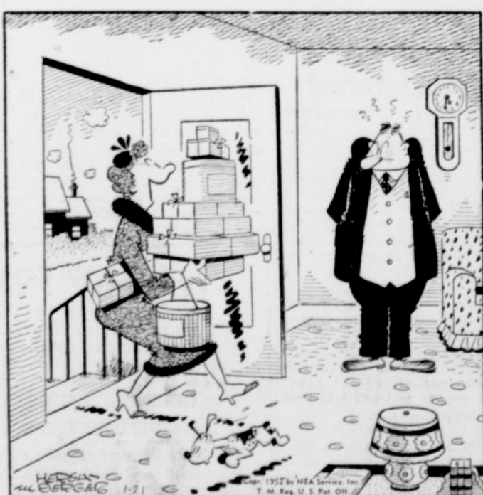
"I've worked all day to balance our budget with your new raise!"