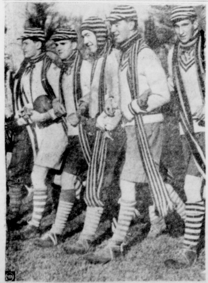
SCARVES AND STRIPES FOREVER—Wearing striped caps, scarves and stockings, the Collegians take the field for the traditional Wall Game against the Oppidans at Eton, Eng.