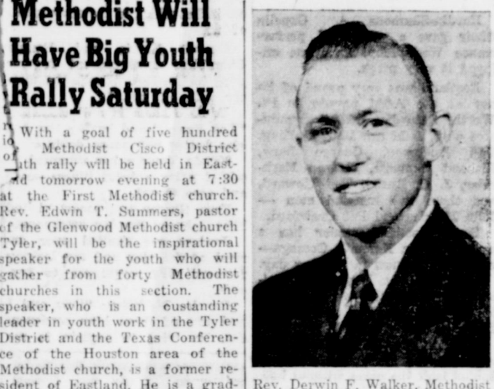
pastor from Edom, will be preacher for the Olden Methodist Church beginning Sunday morn

West Texas-partly cloudy to handle this afternoon.