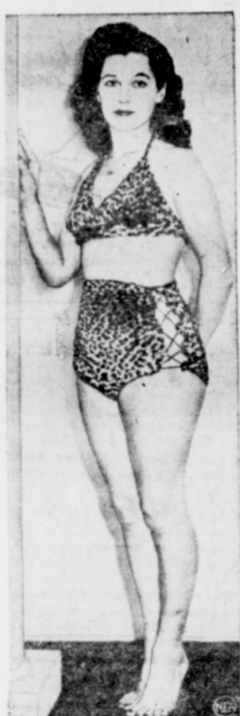
MALE AND FEMALE