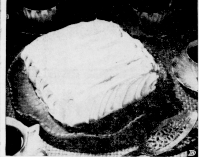
Folks will be delightfully surprised when you cut through the thick fluffy frosting to reveal Marble Cake, a delectable coffee hour sweet.

Through the years cakes have held their popularity as true party desserts. Marble Cake offers a dramatic approach to the dessert problem. Here is an easy marbled loaf cake that you can make at home, if you wish, a thrifty one-egg recipe for something extra-special. Or, if you want, buy it baked. The baker daily offers an assortment of fresh cakes designed to please individual tastes and to suit any occasion.