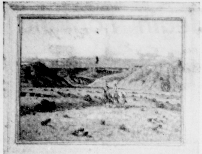
"IN THE CANYON" will be on exhibit here with six other paintings by nationally prominent Texas artists. Lone Star Gas Company purchased the paintings to be used as employee awards for outstanding customer service and has placed them in a traveling exhibit that will visit 47 Texas towns.