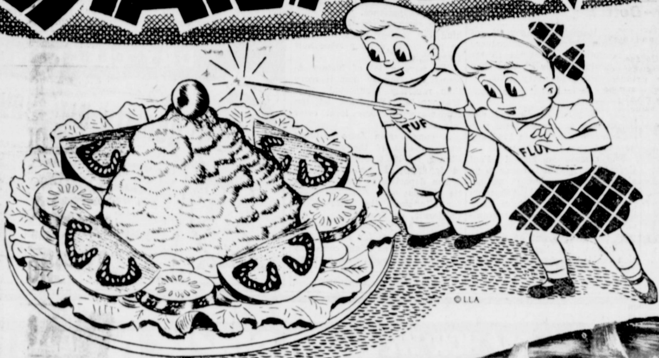
Fluffy says, "Delicious!"