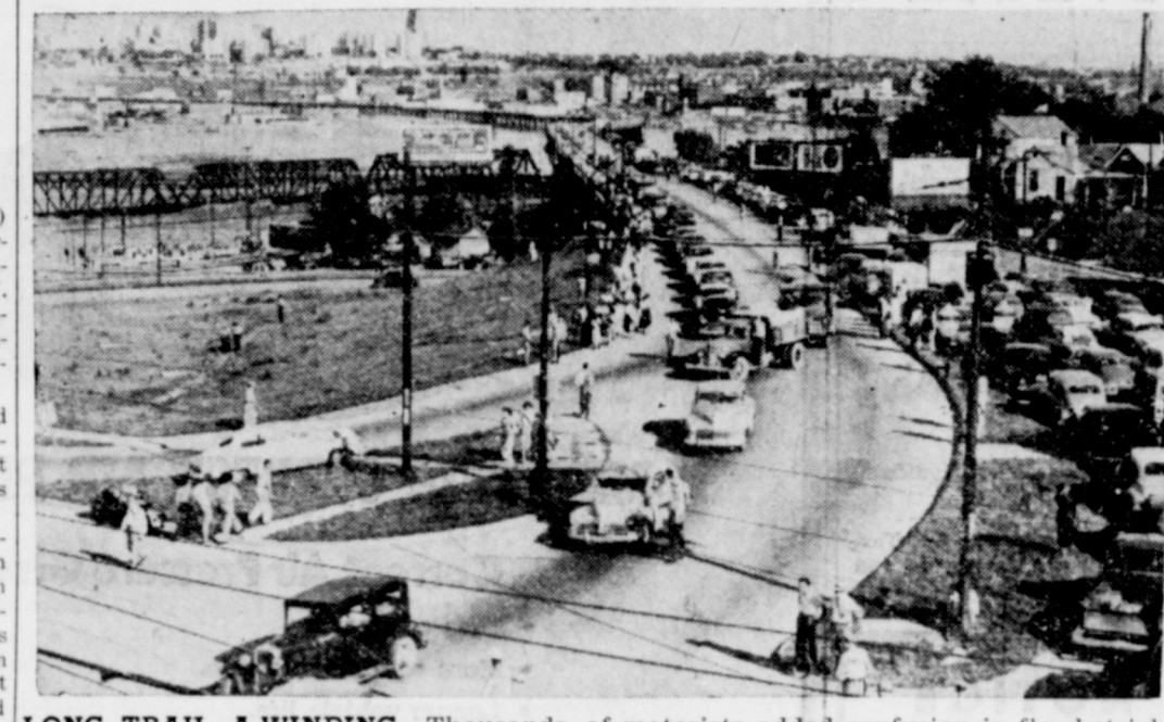
LONG TRAIL A-WINDING-Thousands of motorists added confusion in flood-stricken Kansas City, Kans., as cars jammed bumper to bumper stalled traffic for hours, de- each. spite pleas from officials that rescue work was being hindered. Flooding Kaw River can be seen at left as it meets with the Missouri River.

For Good Used Care (Trade-ine on the New Olds)