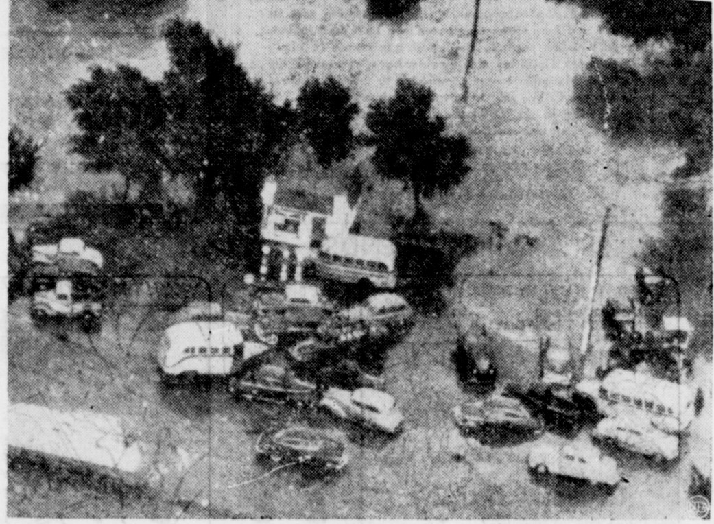
RECORD FLOODS HIT KANSAS-These autos are parked on one of the few stretches of highway 50 between Strong City and Peabody, Kansas. As record flood waters spread over a wide area of Kansas. The Cottonwood River at this spot near Elmdale, Kansas, covered most of the highway. (NEA Telephoto).

For Good Used Care (Trade-ine on the New Olde)