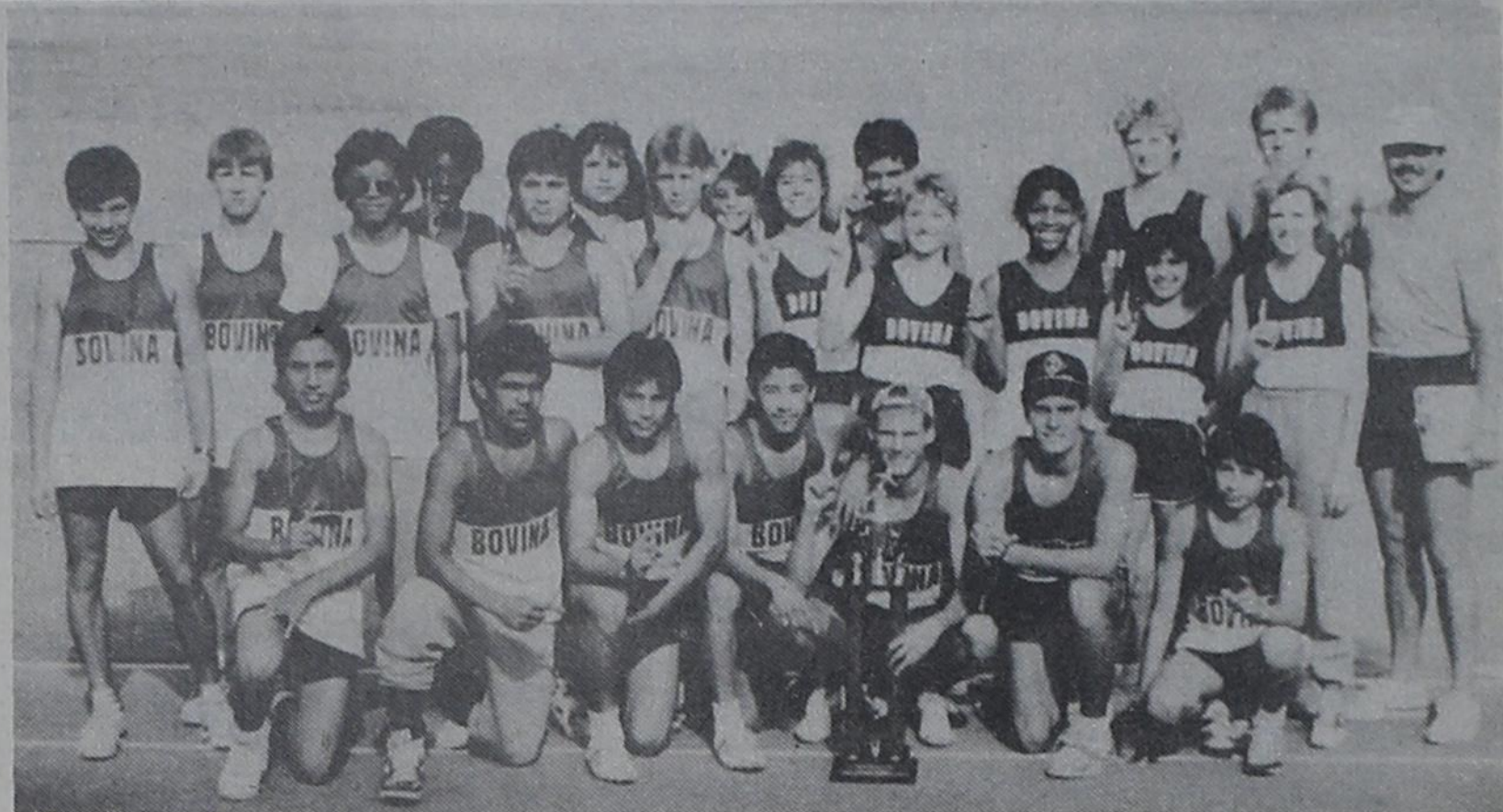
TRACK TEAMS... Members of the boys' and girls' track teams are shown following the Regional meet at Plainview on Saturday. The boys won the regional title, and the girls' qualified four members for the state meet. See details elsewhere in this edition of the Blade.

The jambox is a Magnavox stereo-radio-cassette-recorder. It will be given away April 30 at the Senior Dinner Theater. You do not need to be present to win. The price is $1.00 per ticket.