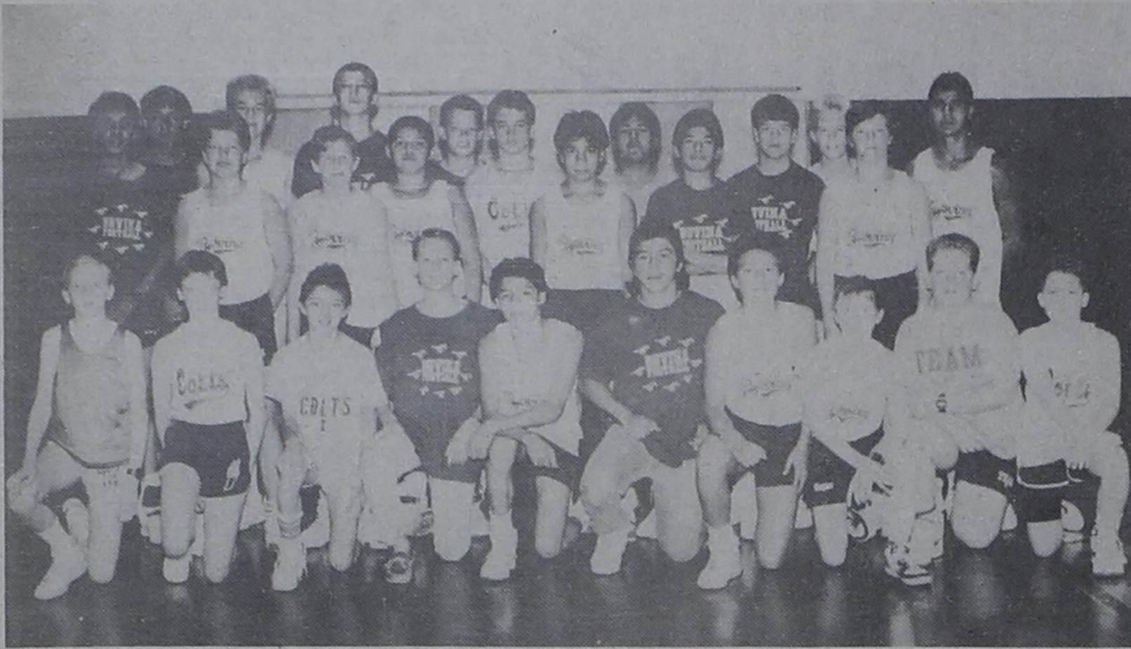
BOVINA JUNIOR HIGH BOYS' track team for 1989