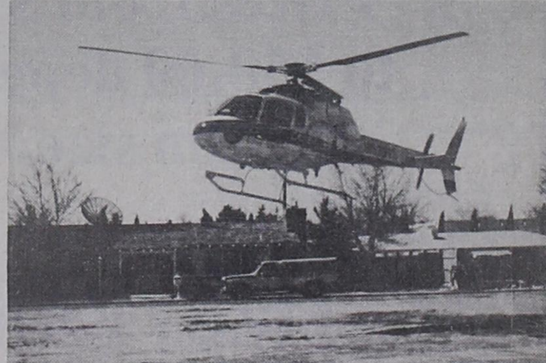
loaded into the helicopter, and the "whirly bird" is shown taking off. Use of the emergency helicopter service is becoming fairly commonplace locally.