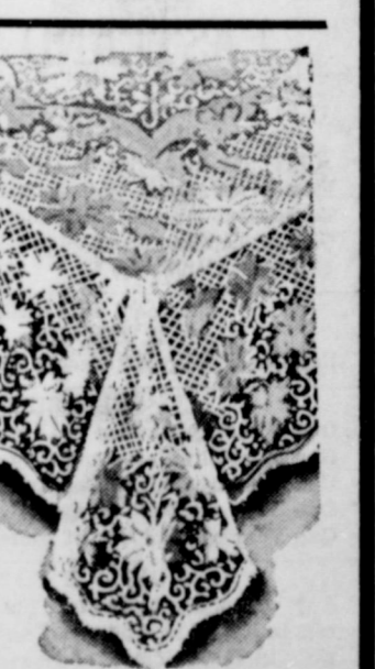
LACE LUNCHEON TABLECLOTH 54" x 70" 3.98