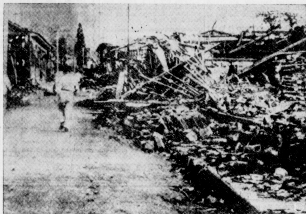
EL SALVADOR QUAKE KILLS 1,000 —Astounded resident walks through the streets of Jucupa, San Salvador, after earthquake struck town May 7. This area, and the town of Chinameca were hardest hit by quake which took heavy toll, killing 1,000 persons and injuring 4,000 others.