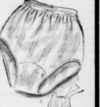
RAYON PANTIES 33c

Mother's Day Value! They're two bar rayon tricot knits with a lovely satin stripe. Well-cut smooth-fitting. In the band leg or elastic leg style. Elastic waist. Sizes small, medium, large.