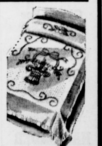
FLUFFY CHENILLE SPREADS Solids, Floral designs. Size 90 x 105 4.98

Mother's Day Value! They're two bar rayon tricot knits with a lovely satin stripe. Well-cut smooth-fitting. In the band leg or elastic leg style. Elastic waist. Sizes small, medium, large.