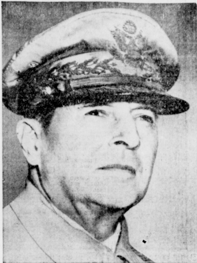
PORTRAIT OF AN OLD SOLDIER—Here is a new camera study of General of the Army Douglas MacArthur, the "old soldier" who has enthralled the nation on his return to a hero's welcome. It was taken as the general surveyed the throngs gathered to greet him in Washington, D. C.

Battle Morn, owned by the Cain Hoy Stable, drew a lot of attention with his closing rush, good enough for second place over In-