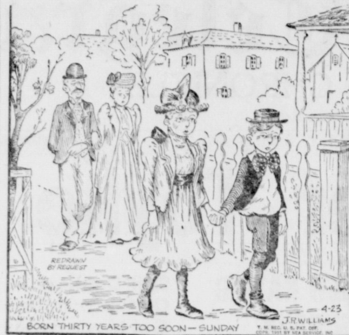
BORN THIRTY YEARS TOO SOON—SUNDAY