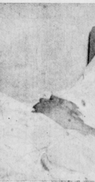
COP STEALS FROM STORE GETS FIRED

Will Play Only Necturnal Against The U. Of Houston WACO, Tex., April 6 (UP)—The Baylor-University of Houston football game in Houston Sept. 22 has been changed from a day-light affair to a night game, the only nocturnal tilt on Baylor's 1951 schedule.