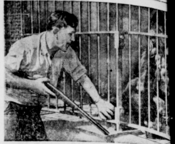
GORILLA AND GUN . . . Head keeper at St. Louis zoo Phil, the gorilla, who has a sore heel and won't refrain from ing it. Every time Phil scratches, the keeper peppers him B-B, so heel will get well.