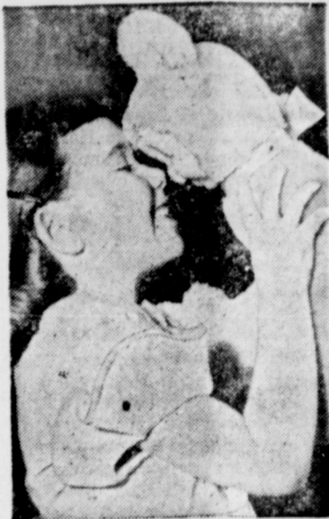
ANTI-ALLERGY . . . This teddy is called Algy, and he's covered with silky rayon plush treated to prevent formation and suspension of dusts.