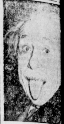
EINSTEIN IRONY . . . Einstein indulges his own whim when photographer him to smile for his birth.