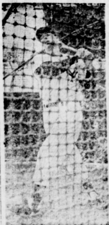
CLIPPER TAKES A CUT . . . Eating cage wire makes check- ered pattern for Joe Di Maggio as he takes a swipe at the ball in Phoenix, Ariz.

This is a "Public Works" Pro- ject, as defined in House Bill No. 54 of the 43rd Legislature of the State of Texas and House Bill No. 115 of the 44th Legislature of the State of Texas, and as such is subject to the provisions of said House Bills. No provisions herein