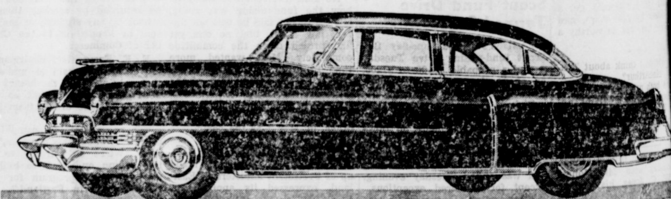
Standard equipment, accessories and trim illustrated are subject to change without notice.

It is true, of course, that when men and women move up to Cadillac, their motivating thought is not economy. Their hearts are set on owning the "Standard of the World." But if they needed another impulse to move them to Cadillac, it could certainly be found in the car's remarkable record for practicality. Even on the basis of its initial cost, a Cadillac represents a surprisingly sound automotive investment. Indeed, some half million American motorists are driving other makes of cars which actually cost them more than they would have had to invest if they had purchased new Cadillacs!