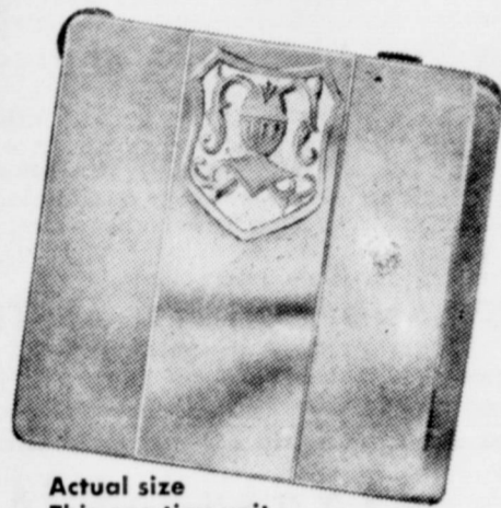
Actual size This one tiny unit is all you wear!

Never Before . . . a Hearing Aid so Small and yet so Powerful!