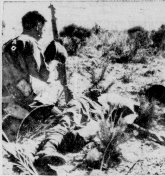
FIERCE FIGHTING NEAR POHANG - An American soldier pauses beside the body of a buddy who fell in the fighting near Pohang, United Nations forces have been thrown out of the coastal town and the Reds are centering their attacks toward Taegu, important hub in the United Nations defense line.