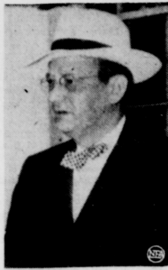
Gordon Dean, acting chairman of the Atomic Energy Commission has been appointed to the Chairmanship by President Truman. Dean is shown leaving the White House just before the announcement was made.