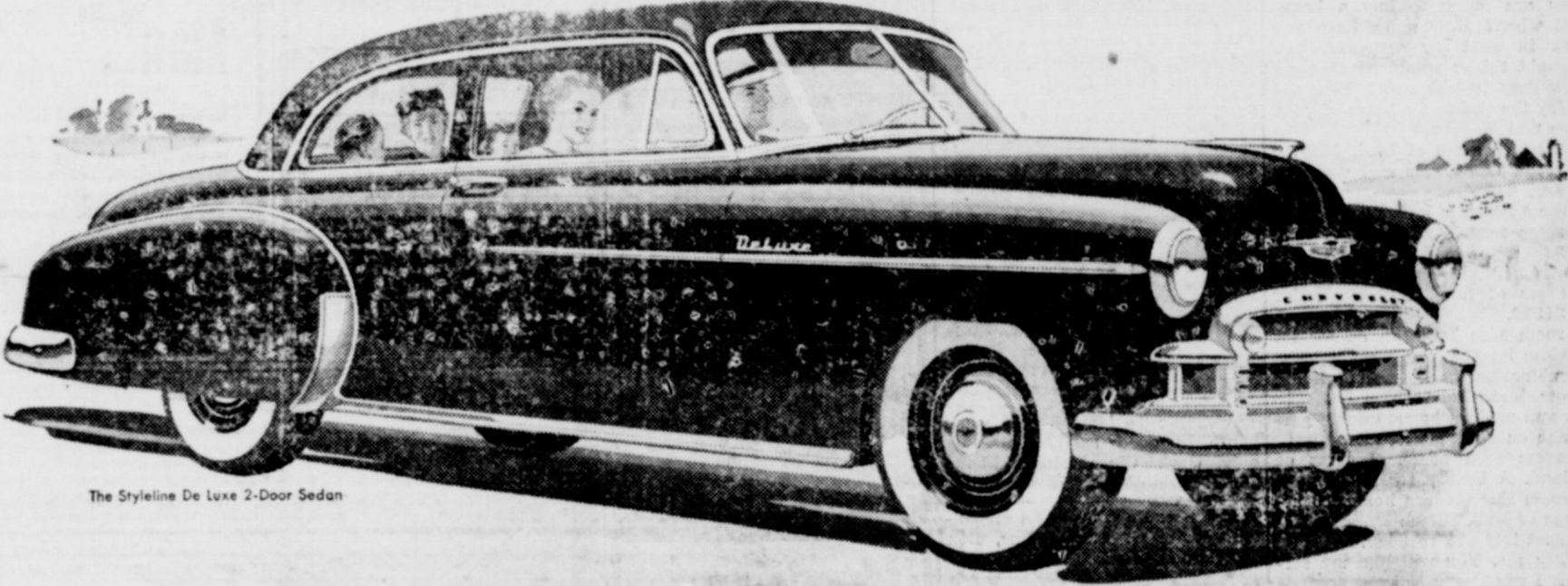
The Styleline De Luxe 2-Door Sedan