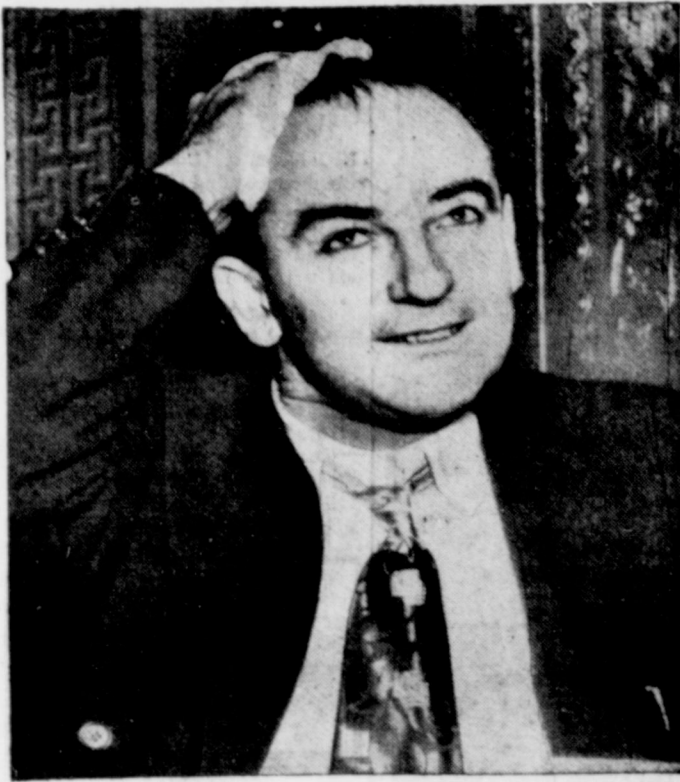
THINGS ARE GETTING HOT—Red-hunting Sen. Joseph McCarthy of Wisconsin seems to be feeling the heat during the controversy over alleged Communies in the State Department. President Truman's blast that McCarthy is "the Kremlin's greatest asset in this country" didn't cool things off.