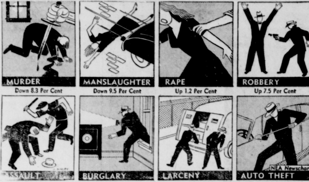
CRIME IS ON THE UP AND UP—Newchart above, based on the new annual report of the FBI, shows the upward trend of crime in the United States in 1949, as compared with 1948. Total increase in crime for the whole country was 4.5 per cent. This represents a 4.2 increase in city crime and a 4.8 increase in crime in rural areas.

The Auxiliary prayer was repeated in unison. The group will meet Monday April 24th at 9.30 A. M. at the Church for the monthly Bible Study.