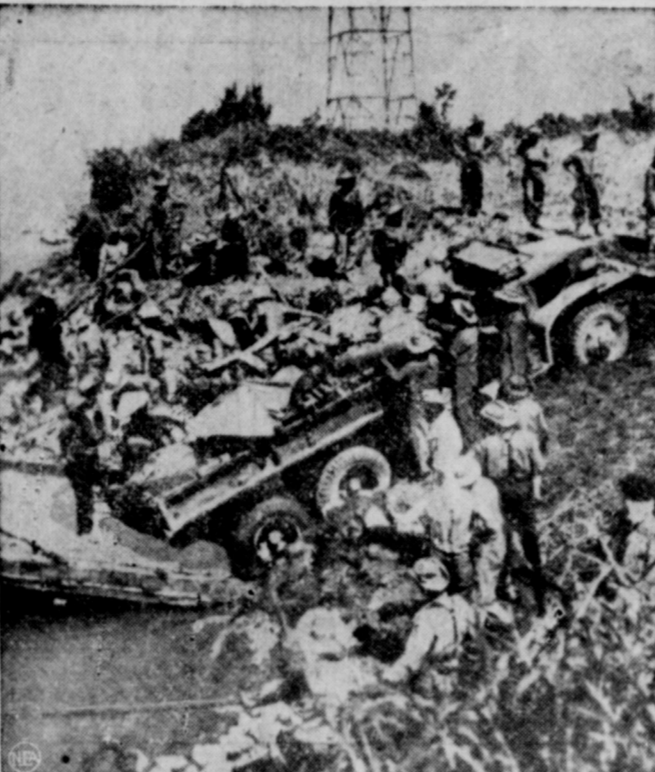
BOGGED IN THE MUD —As in all wars, mud plays an important role in the one now going on in French Indo-China between French-backed Viet-Nam forces and the Communists. This former U. S. Army truck is firmly mired after it collapsed a rotted bridge.

Hammer Appliance Store 205 S. Lamar Phone 623