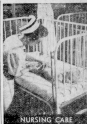
NURSING CARE The Red Cross trained 126,894 persons in home nursing in 1949; in disaster and epidemic areas you find the Red Cross nurse.—GIVE TO THE RED CROSS—

Good Idea Backfires SPOKANE, Wash. (UP)—Jack Snyder wasn't going to let winter's icy blasts freeze up his car. Snyder draped an electric blanket over the motor to keep it warm. There must have been a short circuit because the blanket caught fire and reduced Snyder's car to a charred wreck.