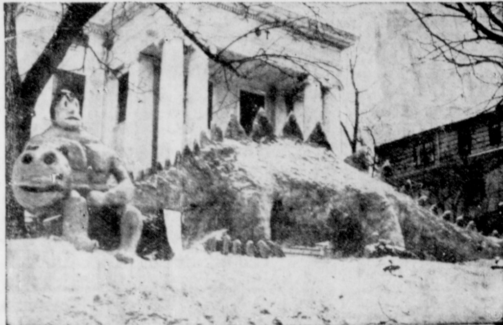
OOP'S TH' WINNAH!—Alvey Oop, the popular comic-strip cave man and his friend, Dinny the dinosaur, carried off top honors for snow sculpture at the winter carnival at Syracuse University, Syracuse, N. Y. The ice carving was done by the men of Psi Upsilon fraternity.