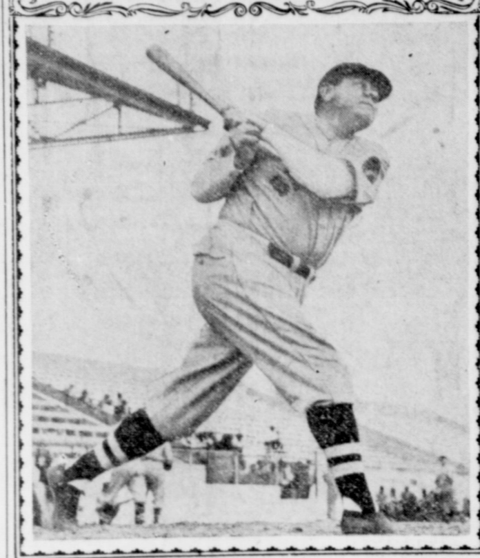
BASEBALL'S MIGHTIEST SLUGGER and most glamorous figure, Babe Ruth, is seen in a typical pose—having just blasted one into the bleachers. A street urchin from the Baltimore waterfront, the Babe captured America's heart with his irresistible personality and amazing athletic prowess. His fame as baseball's home-run king came after Ruth had compiled a spectacular record as a pitcher. The Great Bambino's salary mounted from $600 in 1914 to a peak of $80,000 in 1930 and 1931—baseball's highest at that time, and $5000 more than President Hoover's. Shortly before his death, of cancer in August, 1948, the game paid high tribute to its greatest star in dramatic ceremonies at New York's Yankee Stadium—"The House That Ruth Built."