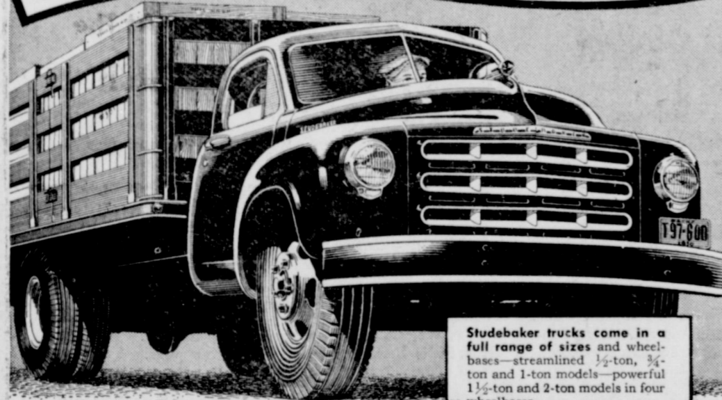
Studebaker trucks come in a full range of sizes and wheelbases—streamlined 1/2-ton, 3/4-ton and 1-ton models—powerful 1 1/2-ton and 2-ton models in four wheelbases.