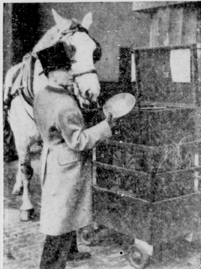
DISK JOCKEY —The chief coachman of Buckingham Palace prepares to play march music to accustom Cunningham, one of the royal horses, to the stirring airs that will mark formal parade to the opening of British Parliament March 6.