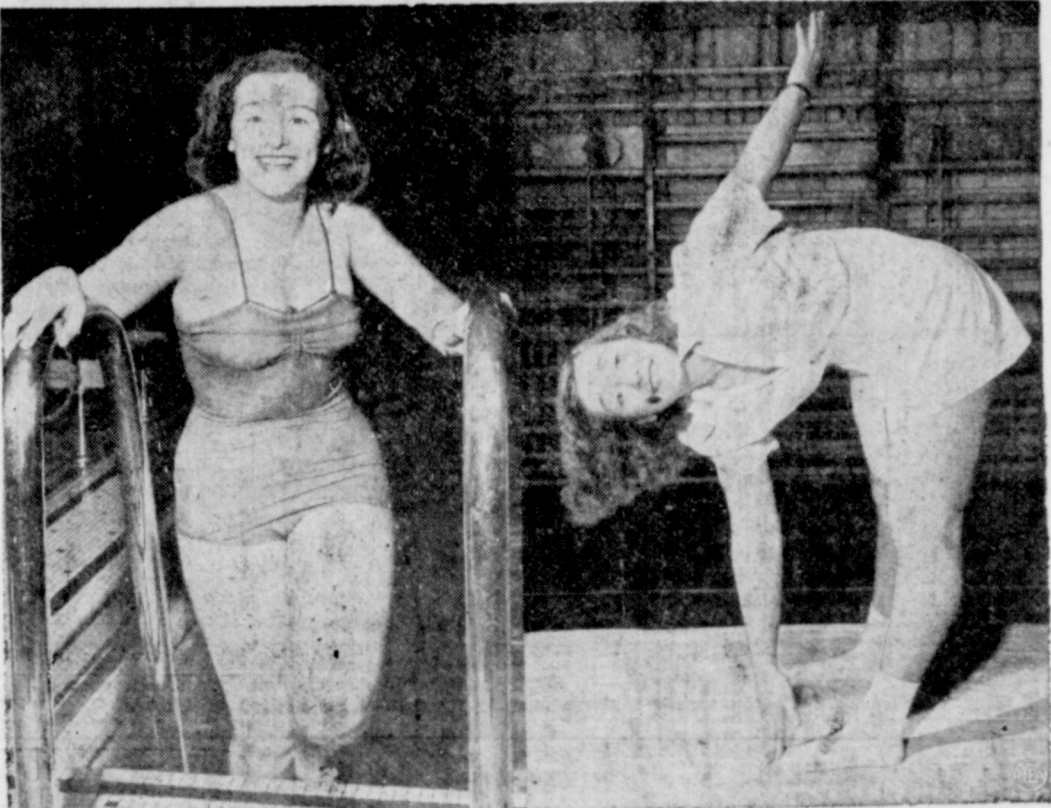
SHIRLEY TRAINS FOR SECOND CHANNEL BID—Shirley May France, the 17-year-old Massachusetts schoolgirl who failed in a gallant effort to swim the English Channel last summer, is training hard for another try next summer. Here Shirley is seen working out in Detroit, where she appeared in a sports show. At left she climbs from a pool after a swim, and at right she does bending exercises which help keep her in shape.