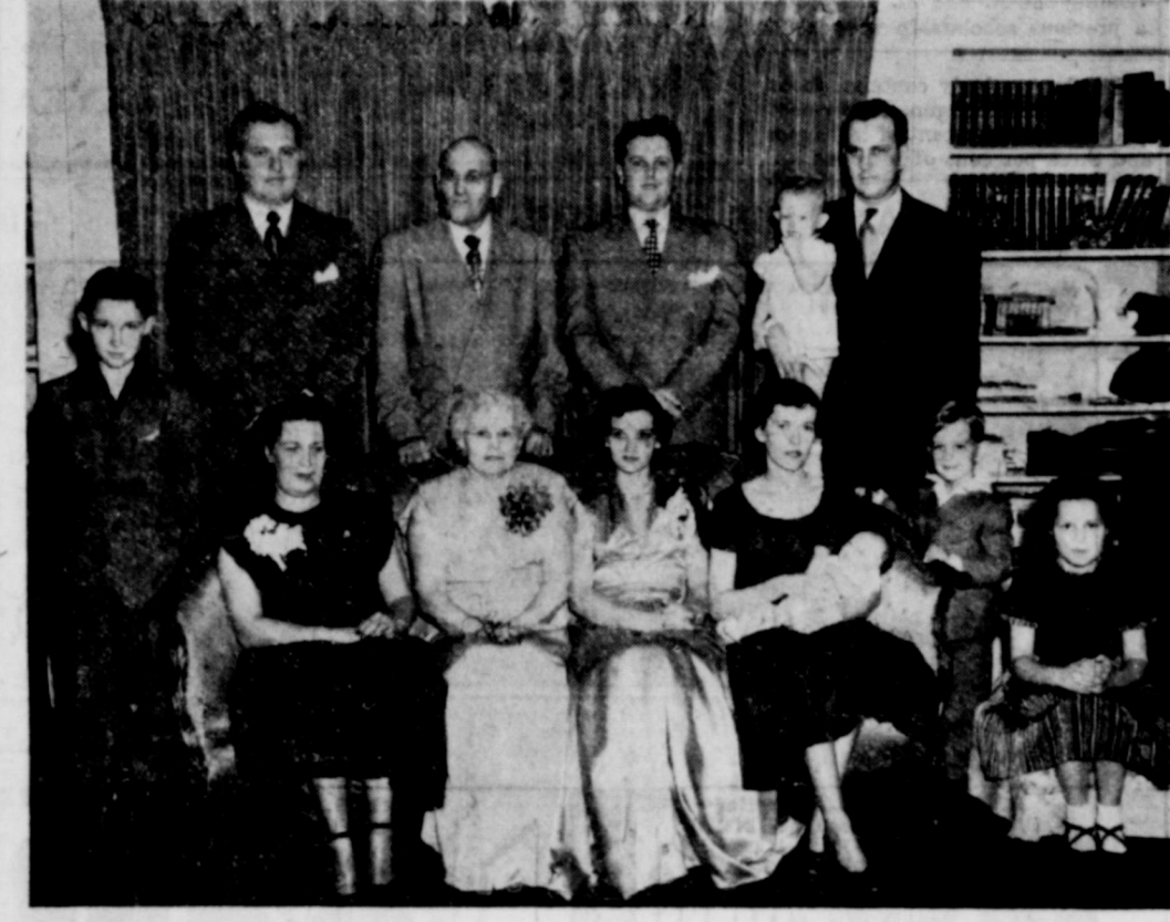
Photo By Lyons Studio J. F. Tucker THE PIPKIN FAMILY . . . Pictured are the three generations of the Pipkin family.

For Good Used Cars ade-ins on the new Olds) no Meter Company, Eastles