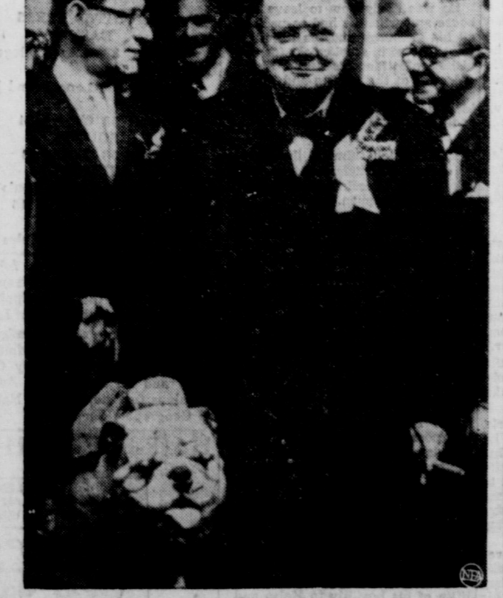
On visit to this constituency headquarters after casting his own ballot, war-time Prime Minister Winston Churchill makes friends with the bull dog mascot. The British peoples voted in a general election which determined the course their nation will follow in the next few years. (Radio-Telephoto.)