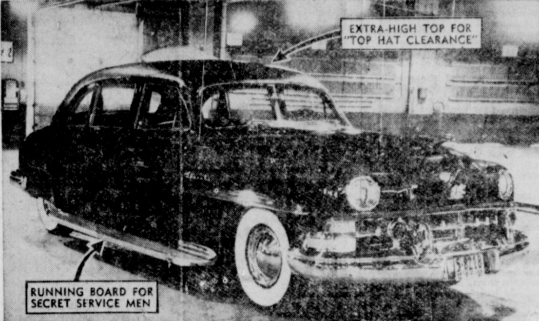
THE TRUMANS HAVE A NEW CAR —Here is President Truman's new super-special, custom-built, oversize Lincoln limousine—first of a fleet of 10 being built for lease to the White House. The car features gold-plated door handles and window controls, automatically operated, plush seats, separate radios and heaters for front and rear compartments, and special red lights all around.