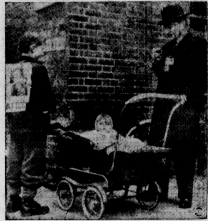
Prime Minister Clement Attlee, having cast his vote by mail, minds baby for mother in London while she is in voting booth casting her ballot in the British General Election.

1. The British voters gave the Communists and left wing fellow travelers a through shellacking.