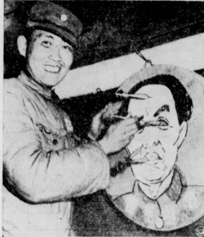
TARGET: MAO —A Nationalist soldier on the island of Chu San—stepping stone to Formosa—looks over the results of his relaxing dart game. The target is a portrait of Mao Tse-tung, Chinese Communist leader.