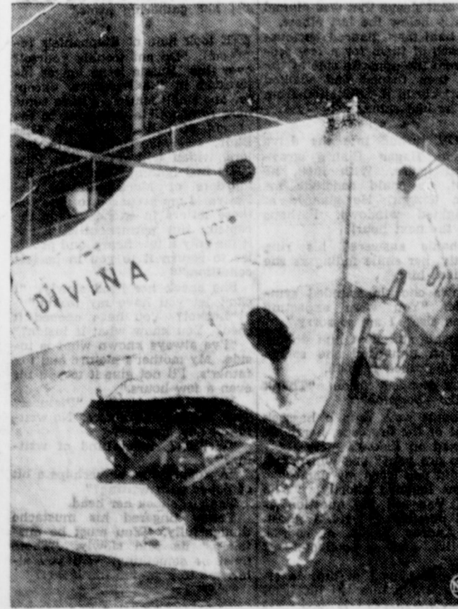
The Swedish freighter Divina arrived at Sherness, England, with her bow caved in following a collision with the British submarine Truclent. Fifteen crewmen aboard the sub escaped, but all others are believed to be dead.