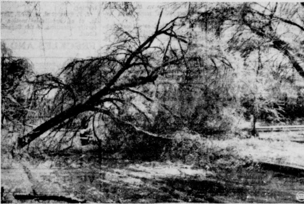
Old man winter roared into Memphis Tenn. on the heels of an ice storm that left widespread damage. This scene was typical of many that greeted the Memphis residents as they struggled to work.