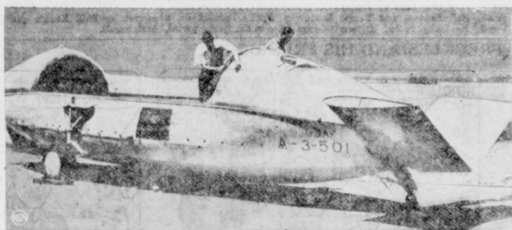
LAST WORD IN AIR-BORNE LIFEBOATS—This new lifeboat, designed to be carried by airplane and dropped by parachute in air-sea rescue operations, would have come in handy during the search for the B-29 that crashed near Bermuda recently. Largest and most completely equipped craft of its kind, the A-3 is nearly 30 feet long and weighs a ton and a half. It has a four-cylinder motor and carries fuel enough to cruise 500 miles. It stocks food and clothing for 15.

During the entire holiday season, starting at 6 P. M. Dec. 23, there were 87 traffic deaths included in the total of 186 violent deaths.