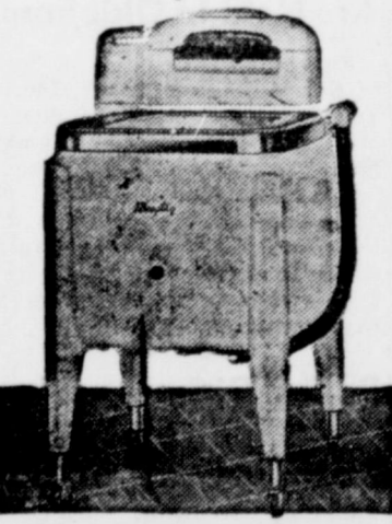
* Over 5 million Maytage soldmore than any other washer.

HAMNER APPLIANCE STORE 105 S. Lamar Phone 623