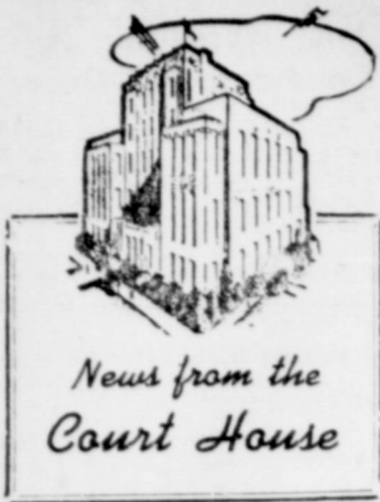
News from the Court House