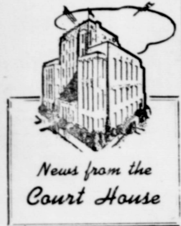
News from the Court House

Any erroneous reflection upon the character, standing or reputation of any person, firm or corporation which may appear in the columns of The Record will be gladly corrected upon being brought to the attention of the management.