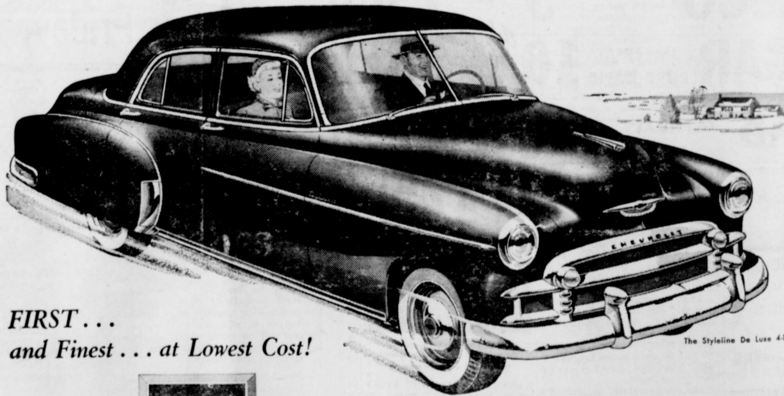
The Styleline De Luxe 4-Door Sedan

Chevrolet alone in the low-price field gives you highest dollar value... famous Fisher Body... lower cost motoring!