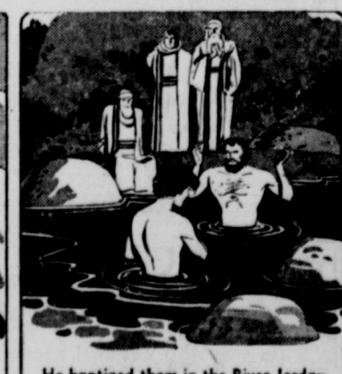
preaching the baptism of repentance for the remission of sins. (Mark 1:4.)