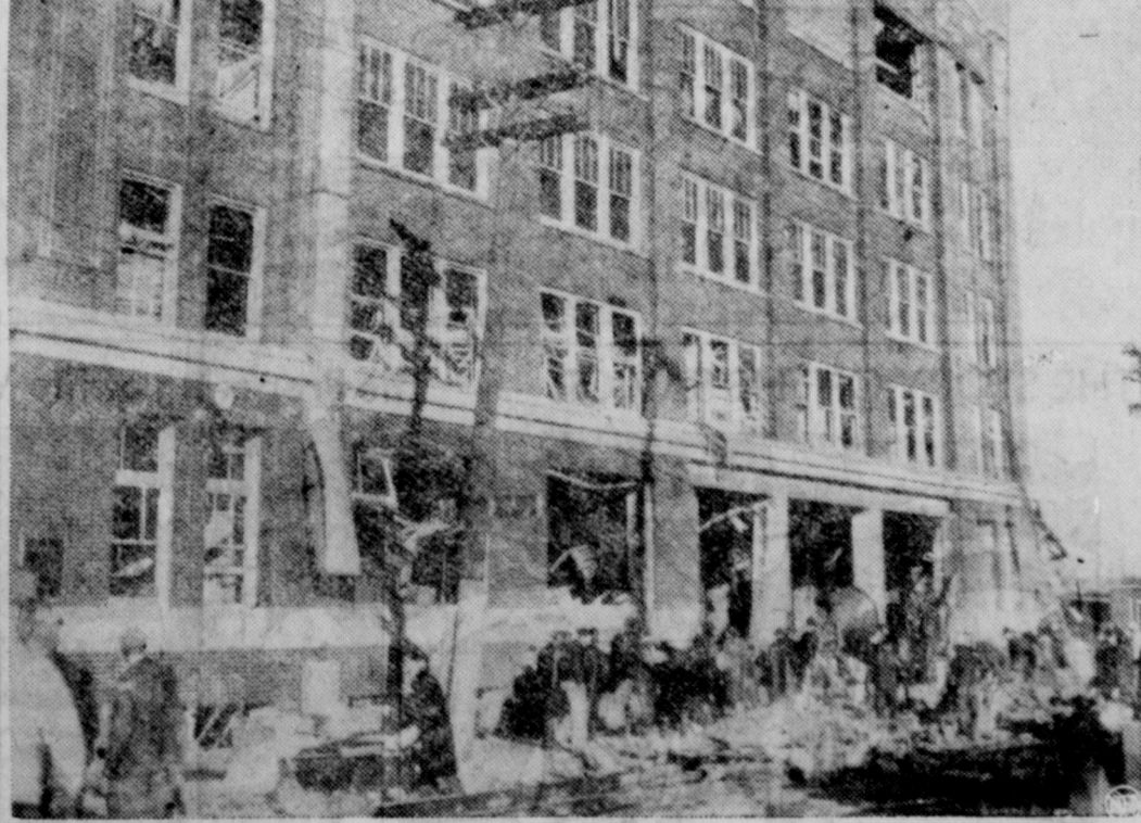
This was the general scene of destruction at the Swift & Company office building in Sioux City, Iowa, following a disastrous explosion. Sixteen were killed and over 80 received a certificate of merit were injured.

Hurry up, Dally, hurry! If you don't get at it now You'd better start to worry.