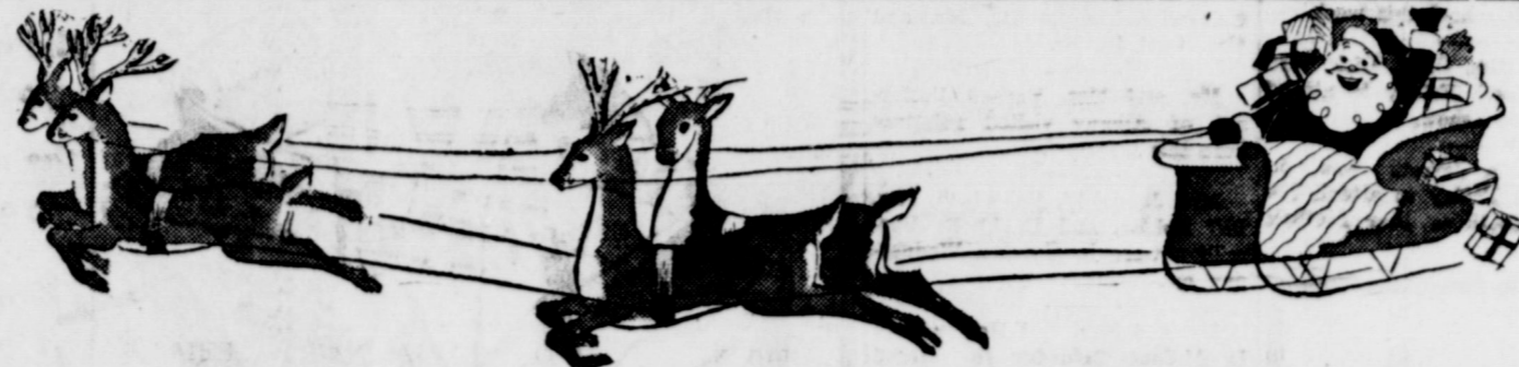
HERE COMES SANTA CLAUS . . . Old Saint Nick, himself, is en route to Eastland to greet all the boys and girls of the area Saturday afternoon at 2:30 o'clock. He has lots of candy to give the kiddies and wants to see each one of you.