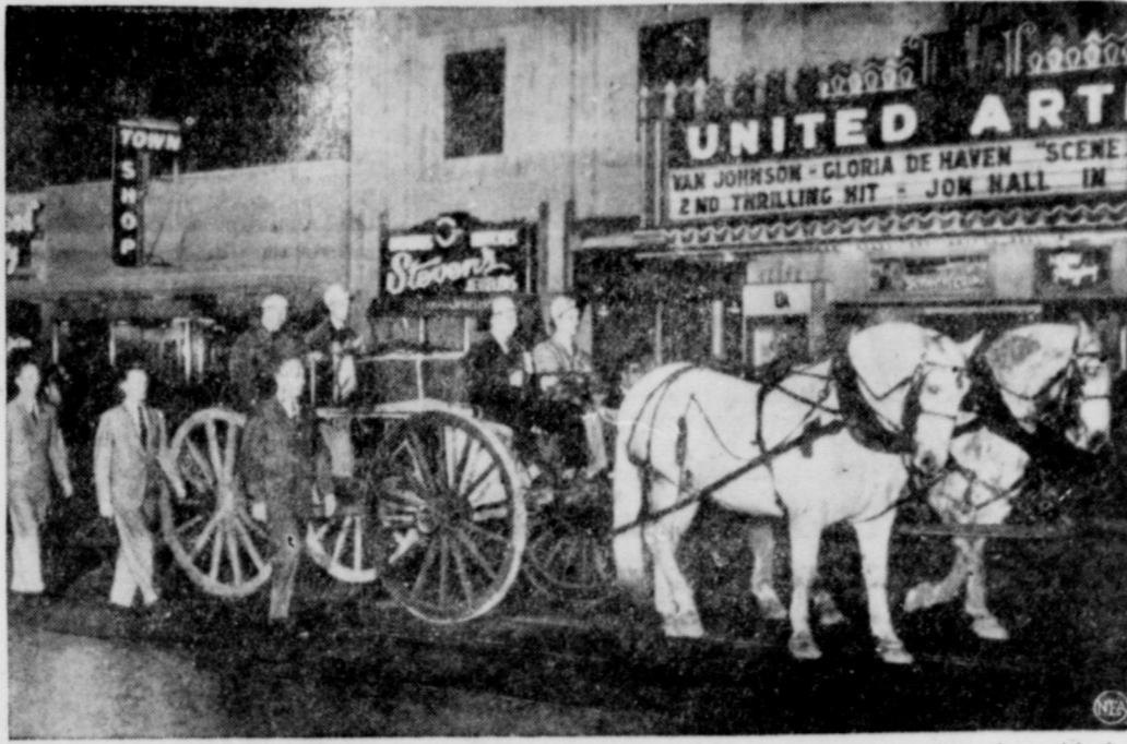
"PUBLIC FUNERAL" FOR NAVY YARD CLOSING —Most funerals occur after the subject has died. This one in Long Beach, Calif., was staged in an effort to prevent a death. The public funeral parade protested Defense Department plans to close the Long Beach Naval Shipyards next June 30. The mock funeral bier was followed by 5000 employees and their sympathizers. The shipyards will be closed as part of Secretary Louis Johnson's economy cut-back in defense spending.