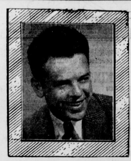
Say, "MERRY CHRISTMAS" In Person, This Year

At Christmas-time your thoughts turn naturally to family and friends. What better way to remember them than by giving truly of yourself? Our "personality portraits" are the ideal way to say "Merry Christmas" to those close to you.