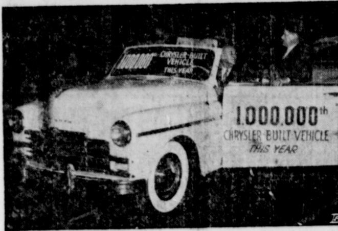
DETROIT—K. T. Keller, right, president of Chrysler Corporation, and D. S. Eddins, president of Plymouth, try out the Plymouth convertible that was the millionth car turned out by Chrysler, breaking its previous record established in 1937.