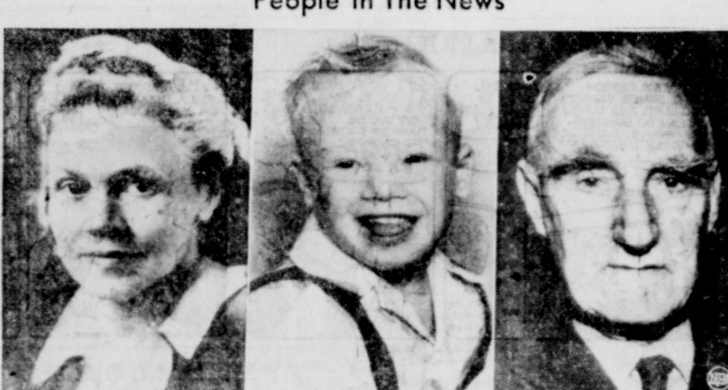
People In The News

Who is Eastland's best good neighbor? That is what the Quarterback Club is anxious to learn and they have nice prizes for the best good neighbor and the person who writes the letter of nomination. The prizes will be awarded in connection with the Breakfast in Hollywood show Tuesday, Nov. 8 at the high school gymnasium. Literary style of the letter will not be considered by the judges with the selection to be based on the reasons given why a certain person is Eastland's best good neighbor. This way, everyone has an excellent chance to win. Write your letter today stating why a certain person is Eastland's best good neighbor and address it to QUARTERBACK CLUB, EASTLAND, TEXAS.