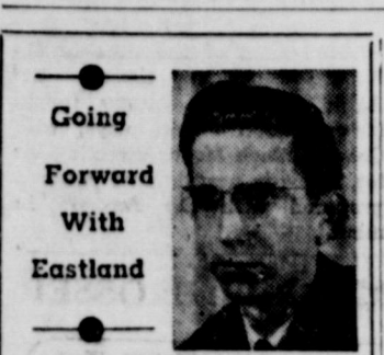
By Bob Moore

The Eastland County Peanut exhibit at the State Fair of Tex-Dallas is everything that could be expected, and more. Located in the center of the big Agriculture building, lighted blocked letters at the top of the exhibit spell out "Eastland County". Another large sign, in colorful print, lists the various communities in the county and what they are noted for. After Eastland, is printed "home of famed horned toad Old Rip, and cermics. Featured in the exhibit are growing peanuts, small bales of peanut hay, signs telling some of the many purposes peanuts are used for, jars of shelled peanuts, and a large natural looking paper peanut mounted on a throne and bearing a crown with the inscription "King Peanut."