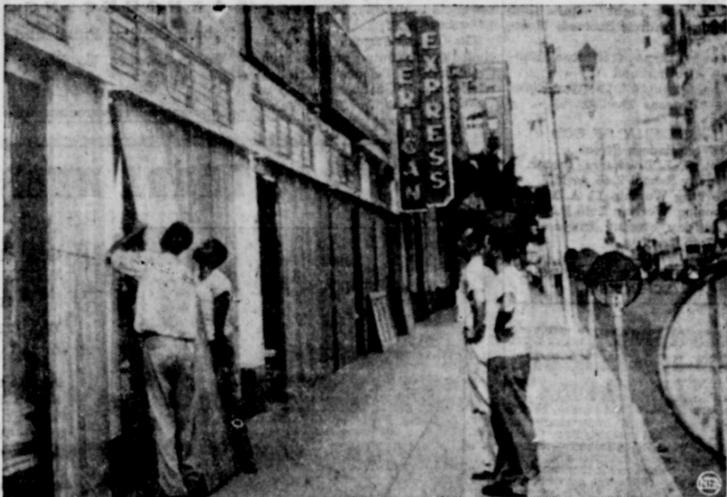
Boarding up store fronts on the world famous Flagler Street in Miami is old story to these veterans of other hurricanes. They watch weather reports and begin their batten-down operations well in advance of the first fringes of the blow.