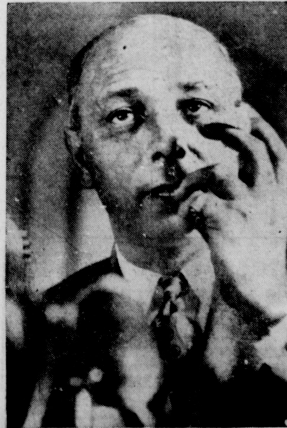
John Maragon, key figure in the Senate investigation of influence selling, as he appeared on the witness stand. He stood on his constitutional rights and told investigators he would refuse to answer questions which might incriminate him.

TAMPA, Fla., Aug. 27 (UP) — A multi-million dollar hurricane that reportedly cost at least three lives and 58 injuries rumbled into the gulf today to revitalize its ebbing power for a possible new strike at the United States mainland.