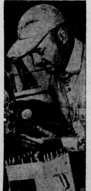
Dr. Otis Barton, Boston marine explorer, checks his underwater camera with which he expected to photograph "strange and gigantic sea animals never before seen by man."

For Good Used Cars (Trade-ins on the new Olds) Osborne Motor Company, Eastland