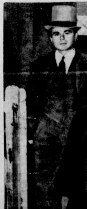
Prince Aly Khan and his bride Rita Hayworth put in an appearance at Epsom Downs, England, to watch the 170th running of the English Derby. Race was won by Nimbus, a seven-to-one shot.