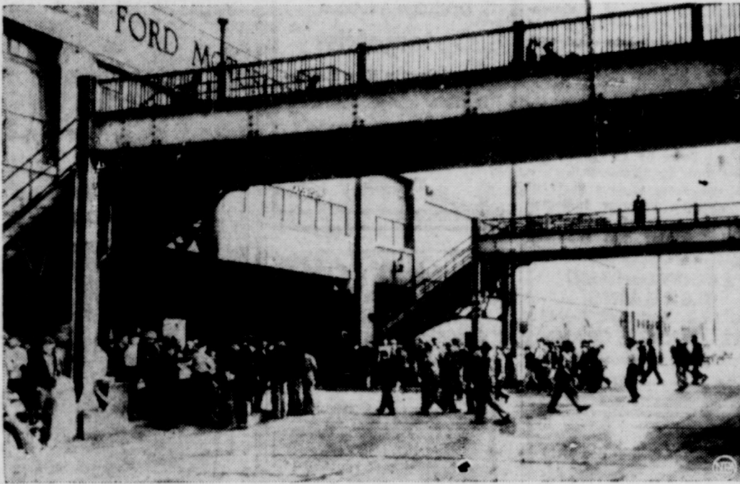
Ford Motor Co. workers in the Detroit area, some 16,000 of them, start back to work at Ford's Rouge plant. Union and company men met to choose an arbitrator to settle the speedup strike issue.