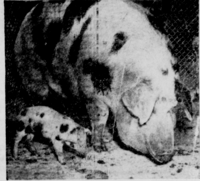
Fig No. 311, a 4-month-old shoat weighing 50 pounds when it was found swimming in radioactive waters of Bikini Lagoon after the first atomic bomb blast in 1946, is now a 600-pounder bound for the National Zoological Park in Washington. The zoo requested the porker when it learned that the Naval Medical Research Institute at Bethesda, Md., had concluded its scientific observation of her. Her only claim to abnormality has been her failure to bear offspring, but radio-biologists say that is not necessarily caused by irradiation. The little pig shown here with her is a grandchild of another surviving pig, but no relation to No. 311, the last surviving Bikini pig.