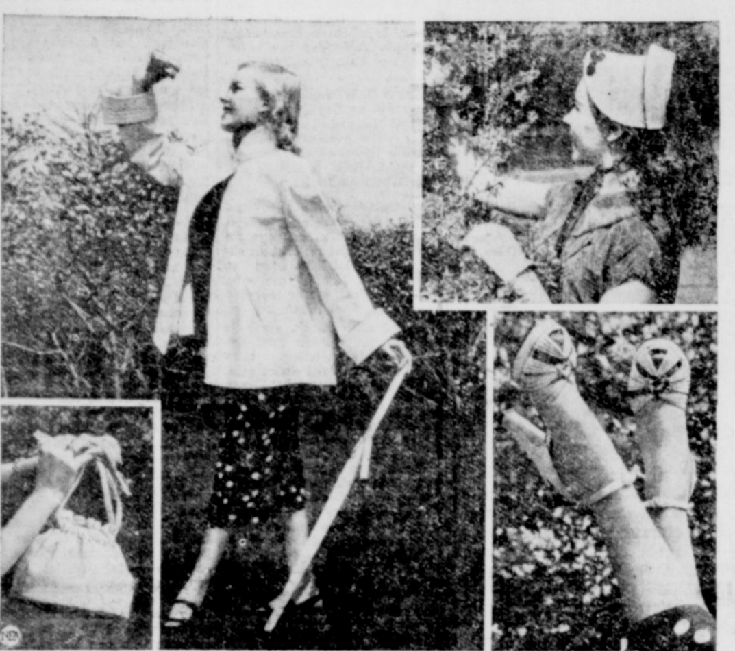
Stark white kidskin which can be wiped free of smudges makes practical and smart accessories for summer prints. Pictured against a background of flowering trees, the model wears a white glazed kidskin coat and carries an umbrella sheathed in more of the leather. Snowy suede kid bonnet has a cuffed crown and navy veil. Swirled strips of kid caught with colored bands form the vamp of platform sandals. Drawstring carry-all of white crushed kid is lined with bright India print.

NEW YORK — (NEA) — Blue Monday will be a rosier day for women in white this summer, thanks to white kidskin. This lady's leather which can put its stark white accent on print costumes all along the line from hats to shoes can be kept clean by wiping off smudges with a damp cloth. The softness and flexibility of kidskin has made it a designer's choice for the immaculate white coat which is this summer's favorite topper for the bright print dress. Besides making smart coats, kidskin makes hats which can be kept as spotless. Hats of white leather look as feminine as hats of straw and take as nicely to veils, chin ties, buttons and bows. The umbrella sheathe that rarely dares to take white because of the hazards of handling can take it in white kidskin. So can handbags and shoes. When used for smartly-styled shoes, the porous quality of white leather is also a promise of more summer comfort for feet.