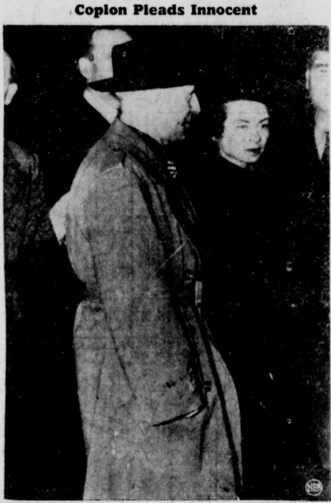
Escorted by a U. S. Deputy Marshal, Judith Coplon, arrives at Federal Court in New York City, where she pleaded innocent to an indictment charging her with espionage. Her $25,000 bail was continued, and trial was set for April first.