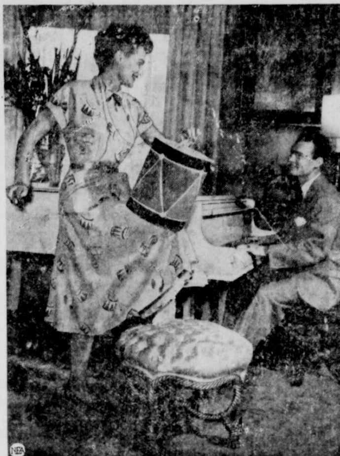
Toys inspire gay prints used for these inexpensive rayon dresses. Drummer-girl (left) poses in a swing-skirted dress which sports bright-printed replicas of her toy drum. Toy balloon which the model is tossing in air (right) is duplicated in miniature to make an all-over motif for her dress.