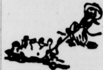
CENTRAL HIDE AND RENDERING CO.

Your Local USED-COW Dealer Remove Dead Stock FREE For Immediate Service PHONE 141 COLLECT Eastland, Texas