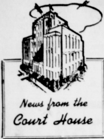
News from the Court House