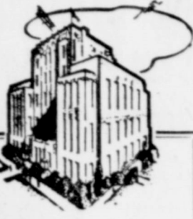
News from the Court House

Any erroneous reflection upon the character, standing or reputation of any person, firm or corporation which may appear in the columns of The Record will be gladly corrected upon being brought to the attention of the management.