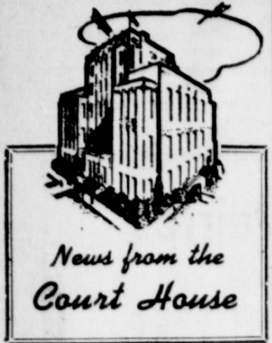
News from the Court House