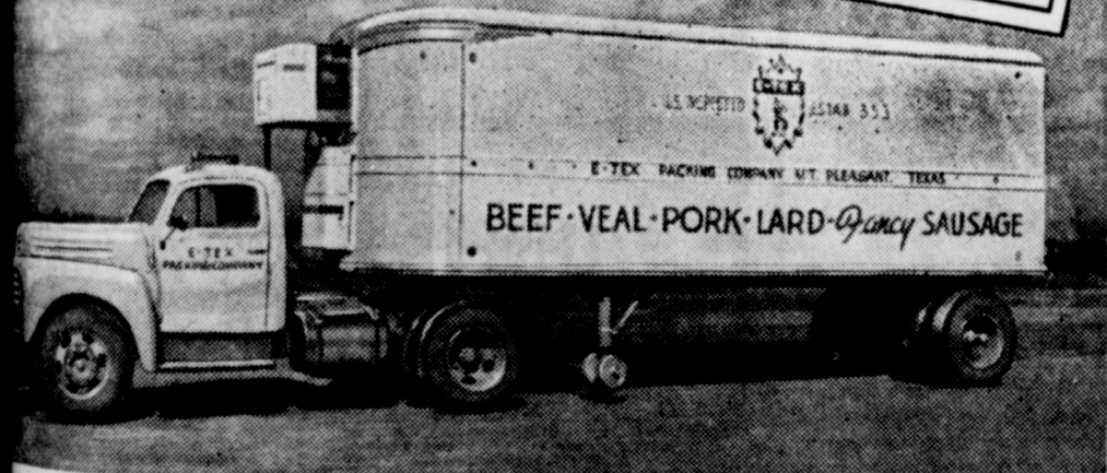
Ford 145-horsepower Model F-7 BIG JOB shows has Gross Combination Weight rating of 35,000 lbs. as a tractor; Gross Vehicle Weight rating of 19,000 lbs.

Our two Ford BIG JOBS have given better performance than any trucks we ever owned