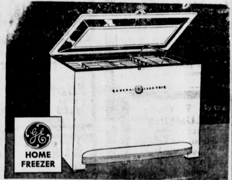
General Electric Home Freezers are available in either 4- or 8-cu-ft models.

NOT ONE OF THESE BEAUTIES WILL GO TO WASTE!