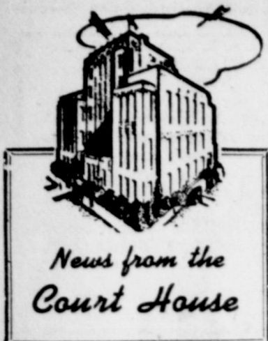
News from the Court House