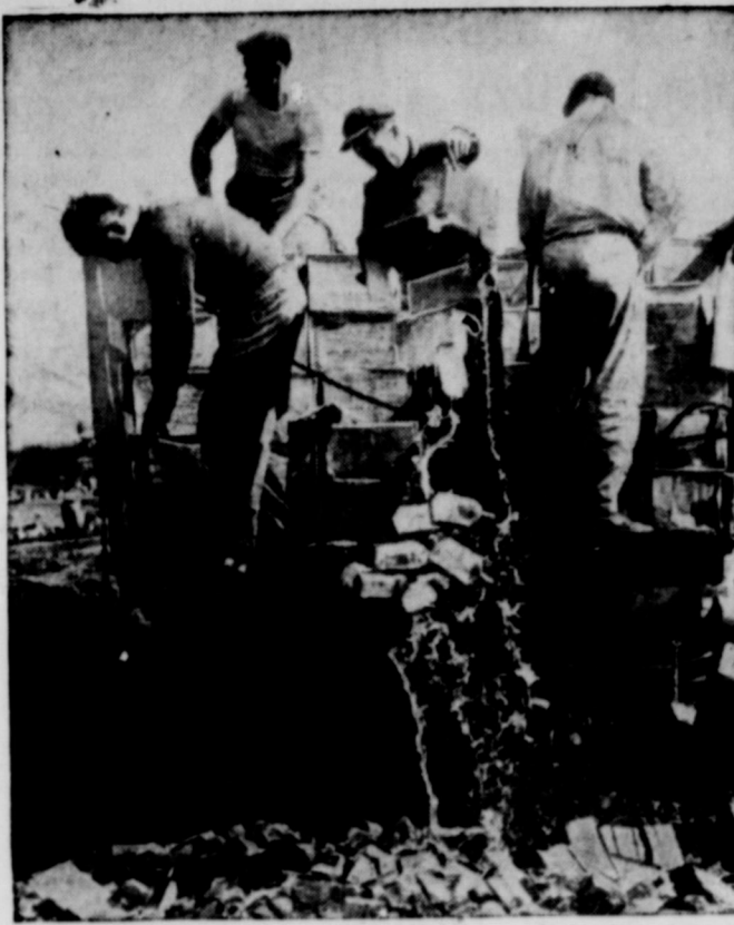
When accumulated import duties and taxes made this gin too expensive to attract customers, it was destroyed. Customs officials watch as workmen wreck 13,416 bottles of Cuban gin, valued at $72,600, in Cincinnati, O.