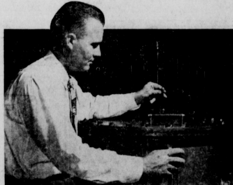
2. Physicists devised this complex apparatus. It duplicates, for scientific purposes, the conditions in the oil-bearing rocks of a developed oil field. From a study of these, the engineers can tell approximately how much oil can be produced, how rapidly it should be produced to secure the maximum amount of oil, even how close the wells should be to each other.

You can help this effort by making your personal demands for petroleum products reasonable and by cooperating with programs designed to conserve oil products.