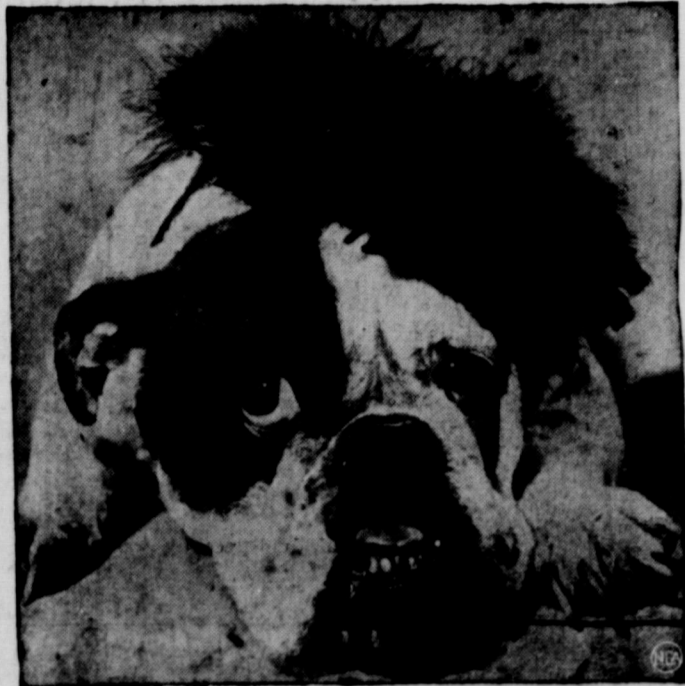
"Caledonia," prize bulldog, certainly leads a dog's life. When they made him model a cocktail-hour hat in Hot Springs, Ark., he registered this look of understandable disgust.