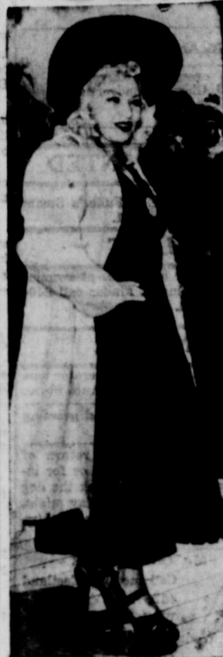
Back from a nine-month trip to England, during which she said she gained five pounds on Britain's "austerity" diet, is Mae West. The "come-up-and-see-me-sometime" actress, arriving in New York, said British men reacted "very good" to her performances in "Diamond Lil."

Majestic TUESDAY & WEDNESDAY Dana Andrews - Merle Oberon NIGHT SONG Ethel Barrymore Hoagy Carmichael