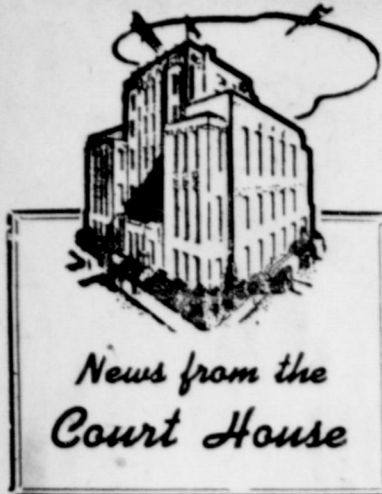
News from the Court House