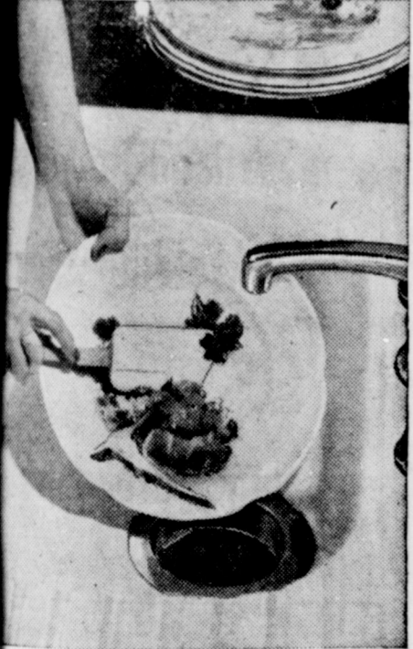
Here's how the Disposall works: Recontrol cover and scrape table refuse drain opening. Replace cover and turn control handle to the "ON" position.