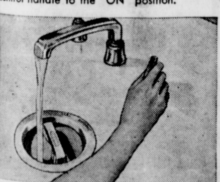
tion starts automatically as soon as on cold water. Scraps—bones and all shredded to bits and washed away.

ere's how the Disposall looks and rms. Arrows show how every particle goes 7 the drain. Unit stays sparkling clean!