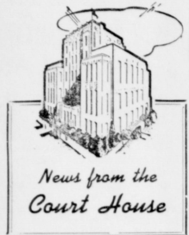
News from the Court House

EASTLAND COUNTY RECORD 112 N. Seaman Street Phone 205