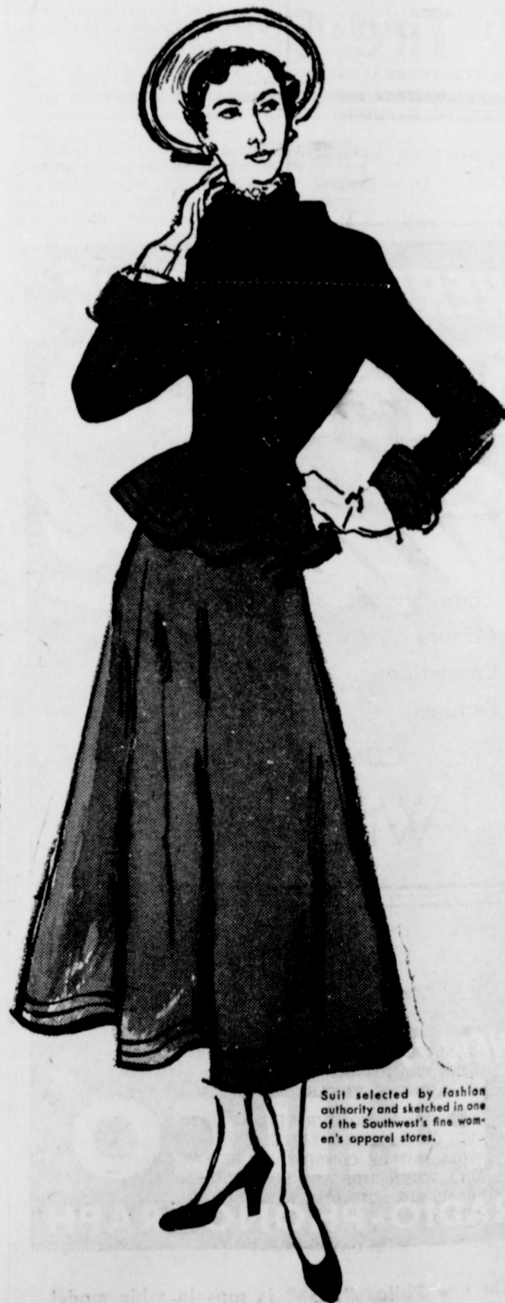
Suit selected by fashion authority and sketched in one of the Southwest's fine women's apparel stores.

see your gas appliance dealer or Lone Star Gas Company